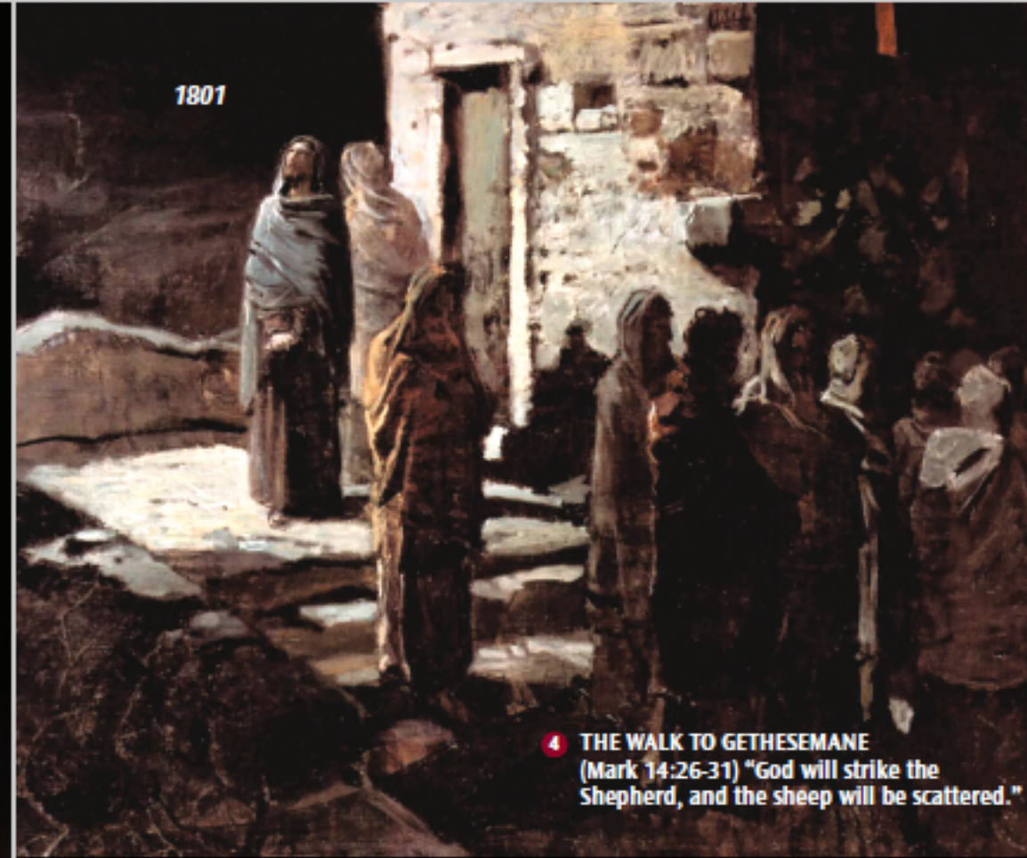
4 THE WALK TO GETHSEMANE (Mark 14:26-31) "God will strike the Shepherd, and the sheep will be scattered."