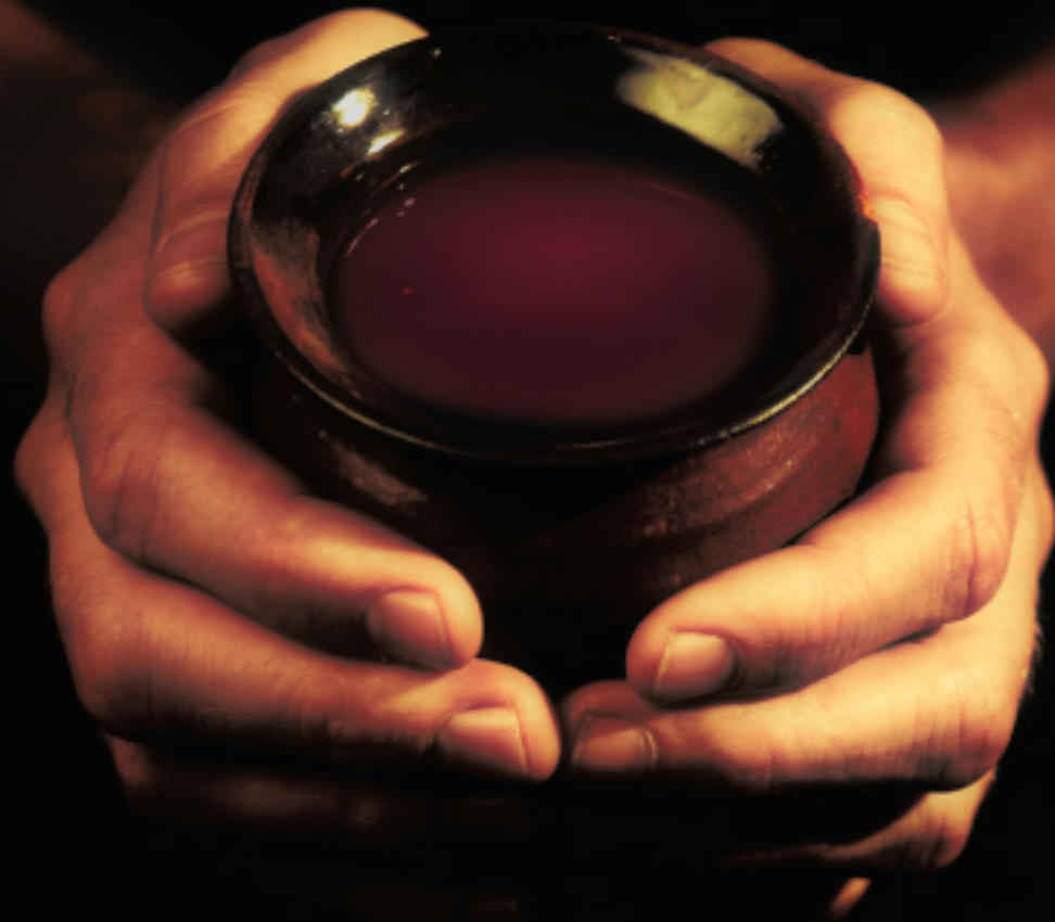
1 THE UPPER ROOM (Mark 14:12-16; Luke 22:7-13) "The Teacher asks: Where is the guest room where I can eat the Passover meal with my disciples?"

Nothing would happen that was outside of his knowledge. Everything was happening according to God's plan.