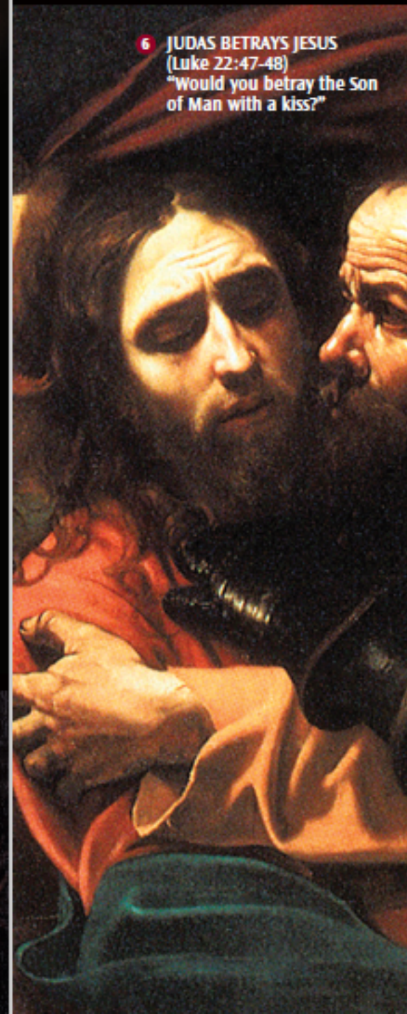
6 JUDAS BETRAYS JESUS (Luke 22:47-48) "Would you betray the Son of Man with a kiss?"

Knowing the time for his death was drawing near, Jesus shared a final Passover meal with his disciples in an Upper Room in Jerusalem (Mark 14:12-25). After the meal, Jesus and his disciples went out to the Garden of Gethsemane on the Mount of Olives, where Judas betrayed him (14:26-52).