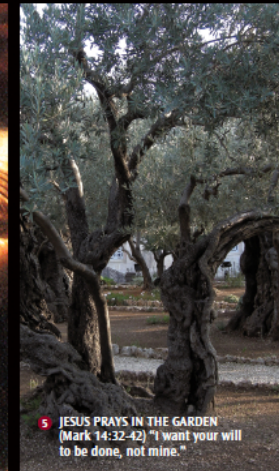
5 JESUS PRAYS IN THE GARDEN (Mark 14:32-42) "I want your will to be done, not mine."